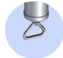
Available with Delta Handle